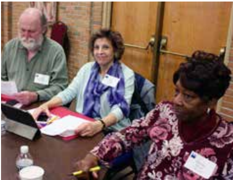
A group from Darlington