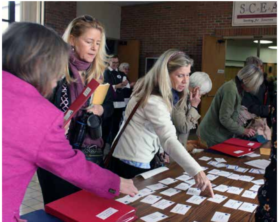
Checking in at League Education and Advocacy Day (LEAD) on Saturday, Jan. 27, 2018