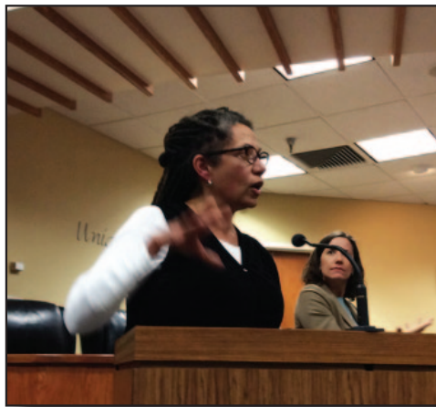
Nikky Finney, an award-winning American poet and South Carolina resident urged attendees at the voting hearing to "Please get involved, don't be silent".

the challenges, successes and opportunities for reform in all aspects of voting in South Carolina. Other topics included vote dilution, voting discrimination, and the implementation of South Carolina's photo ID law.